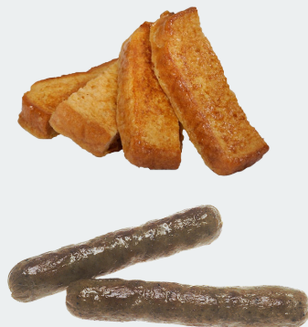
French Toast & Chicken Sausage Links