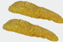
Chicken Tenders & Waffles