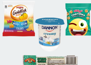
Yogurt Lunch (V)