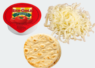
Pizza Kit (V)