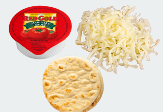
Pizza Kit (V)