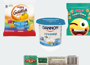
Yogurt Lunch (V)