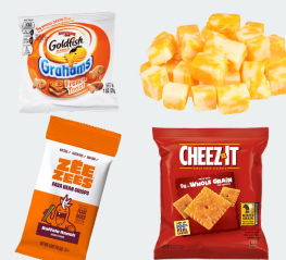
Protein Power Box (V)