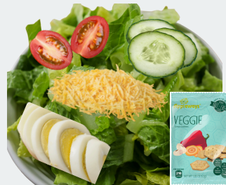
Chef Salad (V)