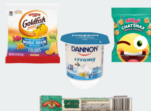
Yogurt Lunch (V)