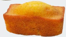
Chicken Spud Bowl