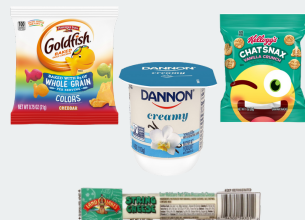
Yogurt Lunch (V)