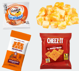
Protein Power Box (V)