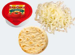
Pizza Kit (V)