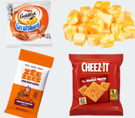
Protein Power Box (V)