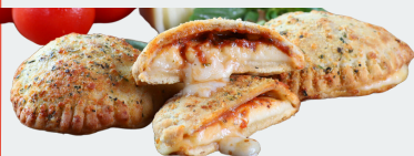
Mini Pizza Pockets (V)