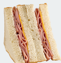
Ham & Cheese Sandwich (P)