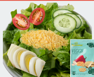
Chef Salad (V)