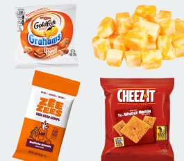
Protein Power Box (V)