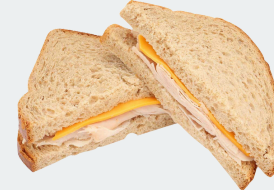
Turkey & Cheese Sandwich (T)