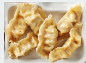
Chicken & Vegetable Dumplings