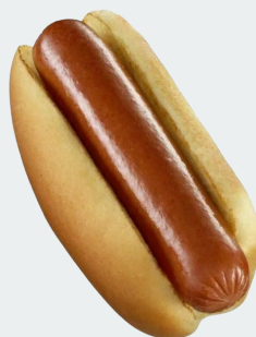
Beef Hot Dog