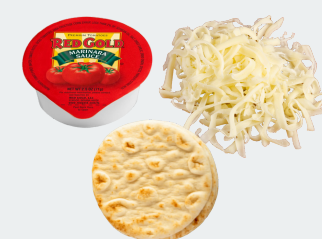
Pizza Kit (V)