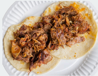
Shredded Barbacoa Tacos (T)